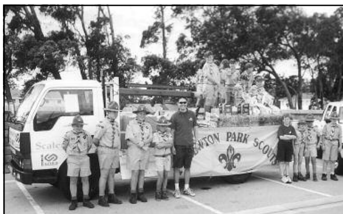
A truckload of food for Animal Welfare